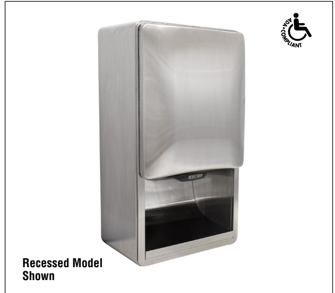
Recessed Model Shown

Verify all rough-in dimensions prior to installation. Recessed unit requires rough wall opening 15 1 / 2 " W x 29 1 / 8 " H x 9 3 / 4 " D. (Semi-recessed unit only 4" D). Secure to framing with mounting screws (not included) at holes provided. Shim at screw points as required.