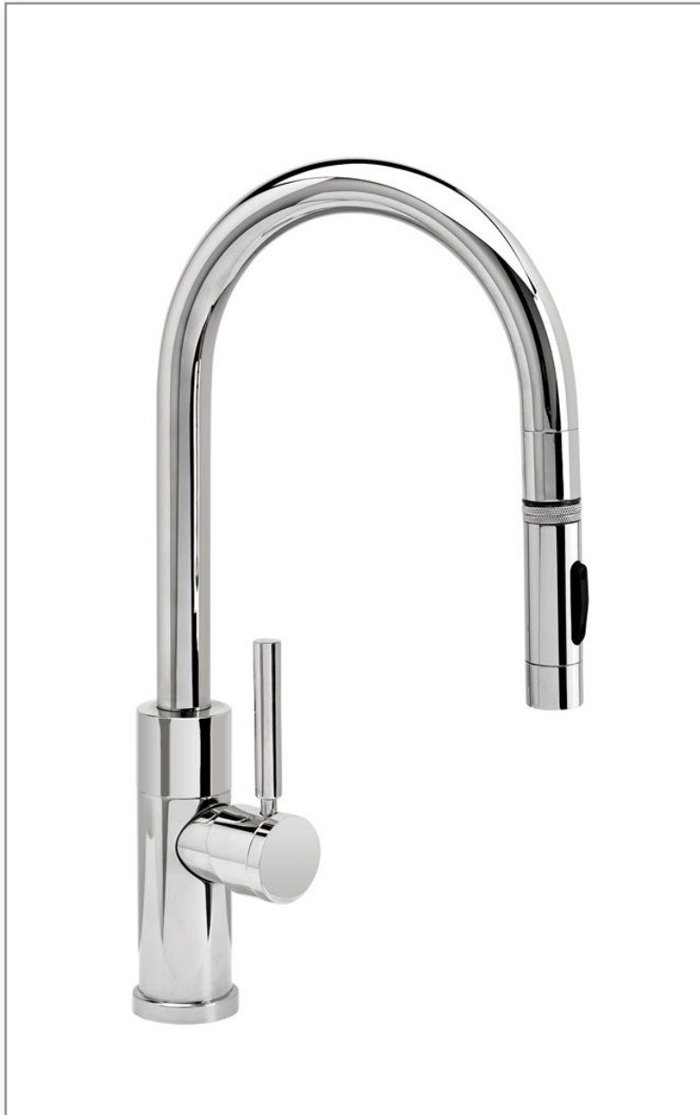
Finish Shown - Chrome