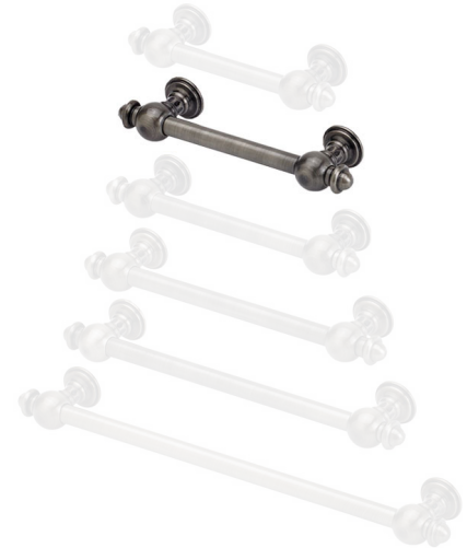
Finish Shown - Antique Pewter