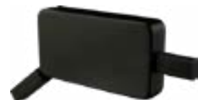
BD1023 ADA 1-3/5" Thumb-lever