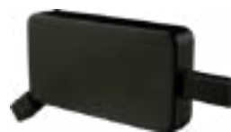
BD1022 Standard 1" Thumb-lever