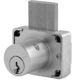
ANSI/BHMA A156.11 Grade 1 E07041

Woodwork Institute (WI) acknowledged product