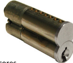
207S For use with Olympus 723S