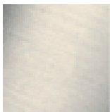
platinum matte 17 861 680-06

Kitchen sink - Lot HOT & COLD WATER DISPENSER - polished chrome Article number: 17 861 680-00