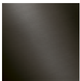
Dark Platinum matte 17 861 680-99

More custom finish options are available via special production (xTra Service). Please see our finish matrix for availability and pricing or contact a Dornbracht representative.