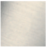
platinum matte 83 500 809-06