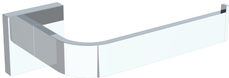
Tissue Holder PDX-TPEURO-PC