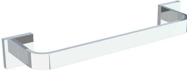
12"/18"/24"/30" Towel bar PDX-TB12/TB18/TB24/TB30-PC