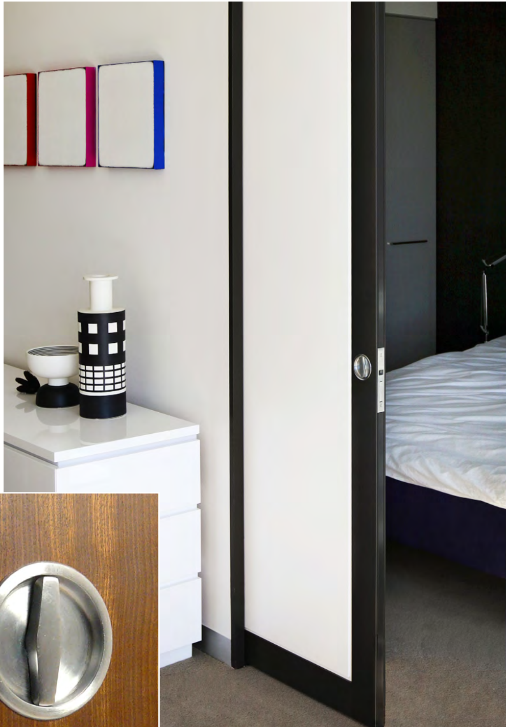
CaviLock CL100 Flush Turn in Satin Chrome

Requires minimum door thickness of 1-1/2" (37mm).