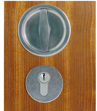
CL100 Flush Turn with key.

Please note that this specification is suitable for 1-3/4" thick doors and must be done at time of order.