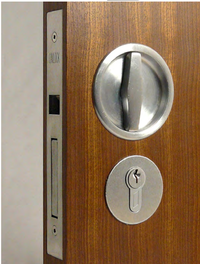
CaviLock CL100 Flush Turn with Key in Satin Chrome